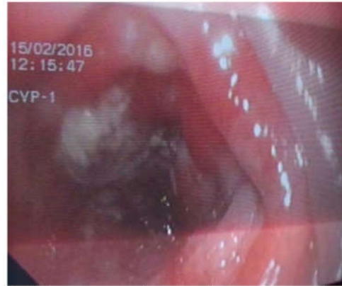
Fig. 2. Colonoscopy showing hemorrhages in the colon

of crypts was one of the earliest histopathological changes seen in canine colitis which was noticed in the present case.