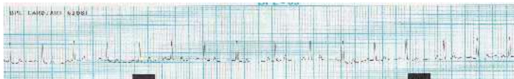
Fig:1 Normal E.C.G in healthy animals

Hence electrocardiography can be used as a diagnostic tool in detecting the electrolyte changes in uremic dogs and for further medical management.