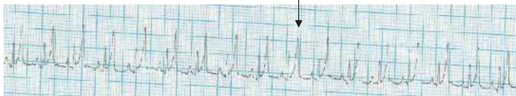
Fig:2 Spiked T waves