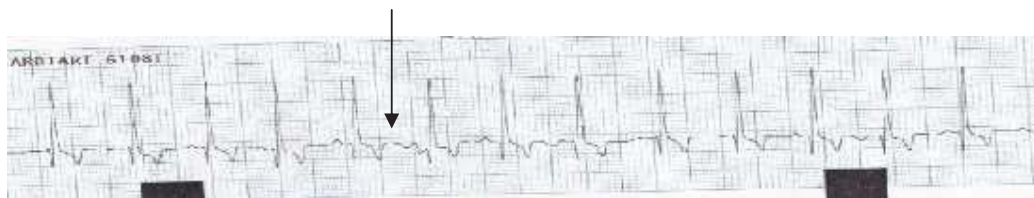
Fig: 5 ST depression