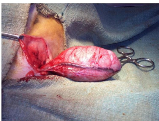
Fig.1: Exposed ectopic testis (right side) through surgical intervention.

The dog was anaesthetized with Atropine sulphate @0.04 mg/kg bwt, Xylazine Hcl @1 mg/kg bwt and ketamine Hcl@5 mg/kg bwt and the site was prepared aseptically. A longitudinal incision was given on the periphery of swelled portion towards the side of penile portion. The testis was separated by blunt dissection with finger and removed through a linear incision after double ligation of the spermatic cord with chromic cat gut No. 0 (Fig-1). The left testis was also removed by same procedure (Fig.2). The subcutaneous tissues were sutured with absorbable suture materials and skin with nylon by cross mattress pattern.