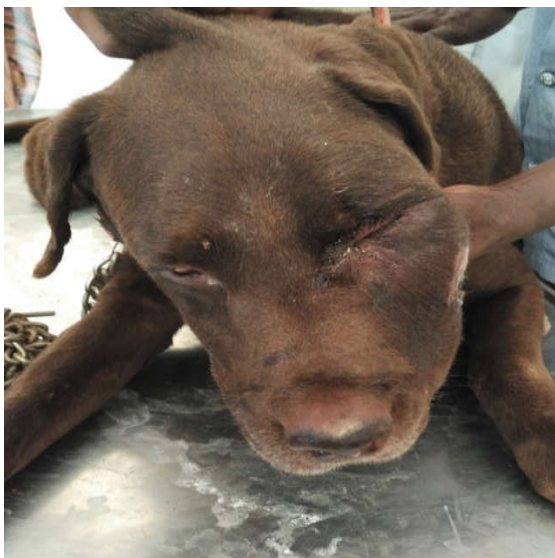
Fig.1: Huge swelling beneath the eye enclosing the eyeball

A male Labrador dog was presented to the College of Veterinary Science, Proddatur with the swelling of 8cm diameter approximately beneath the left eye along with difficulty in mastication (Fig.1). History revealed that initially it was small in size which was neglected and which further resulted in sudden increased in size covering the entire eyeball affecting its vision. Radiography revealed soft tissue swelling with brush border appearance on maxilla but without (Fig.2). FNAC was taken from 3 different sites of which one from buccal mucosal surface and two were taken on external swelling which revealed malignant cells with increased number of neutrophils. Later it was confirmed as osteosarcoma in histopathology of biopsy sample. Knowing the complications the owner did not agree for its radical therapies. However to place it on record the condition is reported.